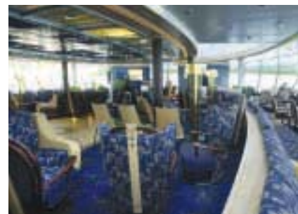
There is an ocean of impressions between the cabins on the 2nd deck and the panorama lounge on the 8th deck.