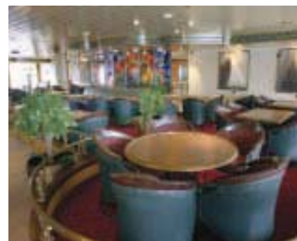
Mørestuen, deck 4