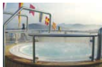
On the new MS Finnmarken you can do what they did in 1912 – take a refreshing shower on deck.